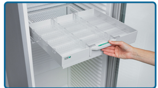
Option of drawers with dividers